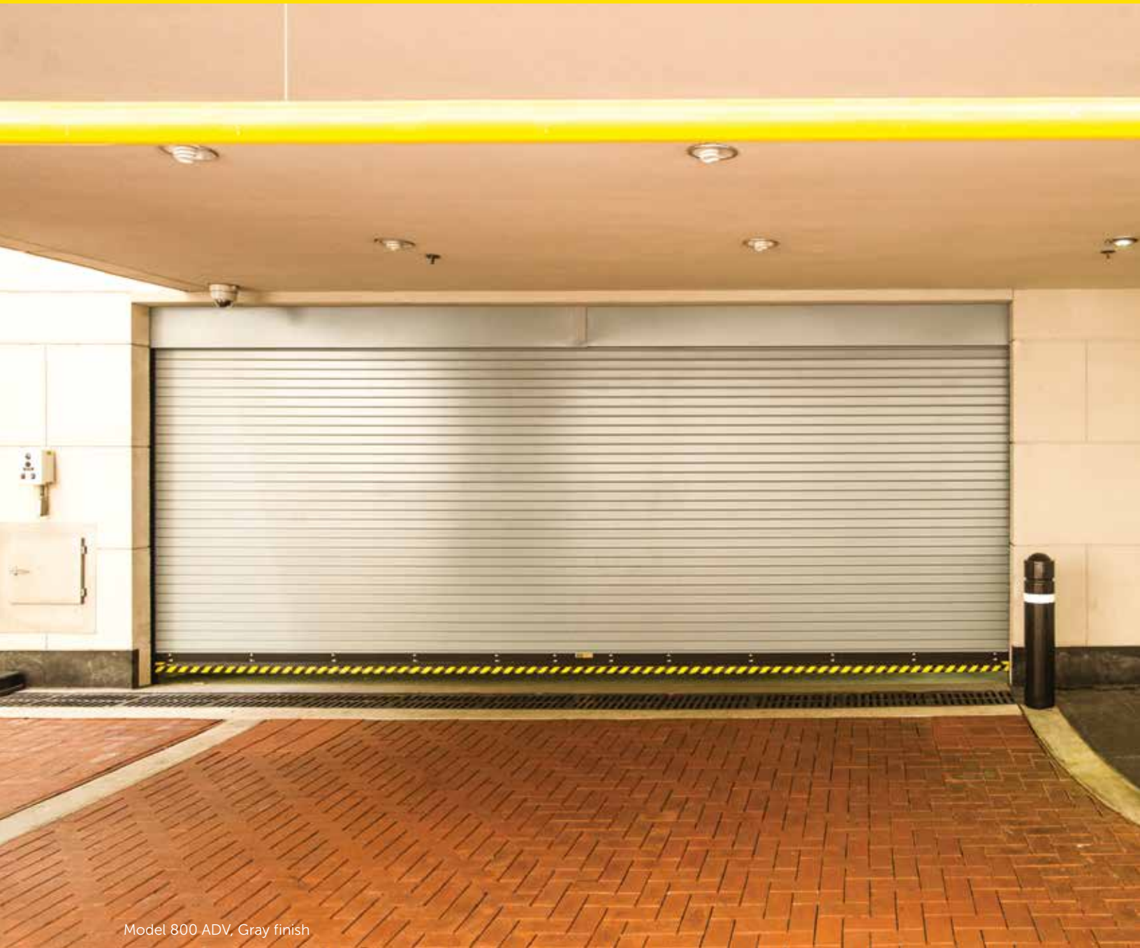
Model 800 ADV, Gray finish