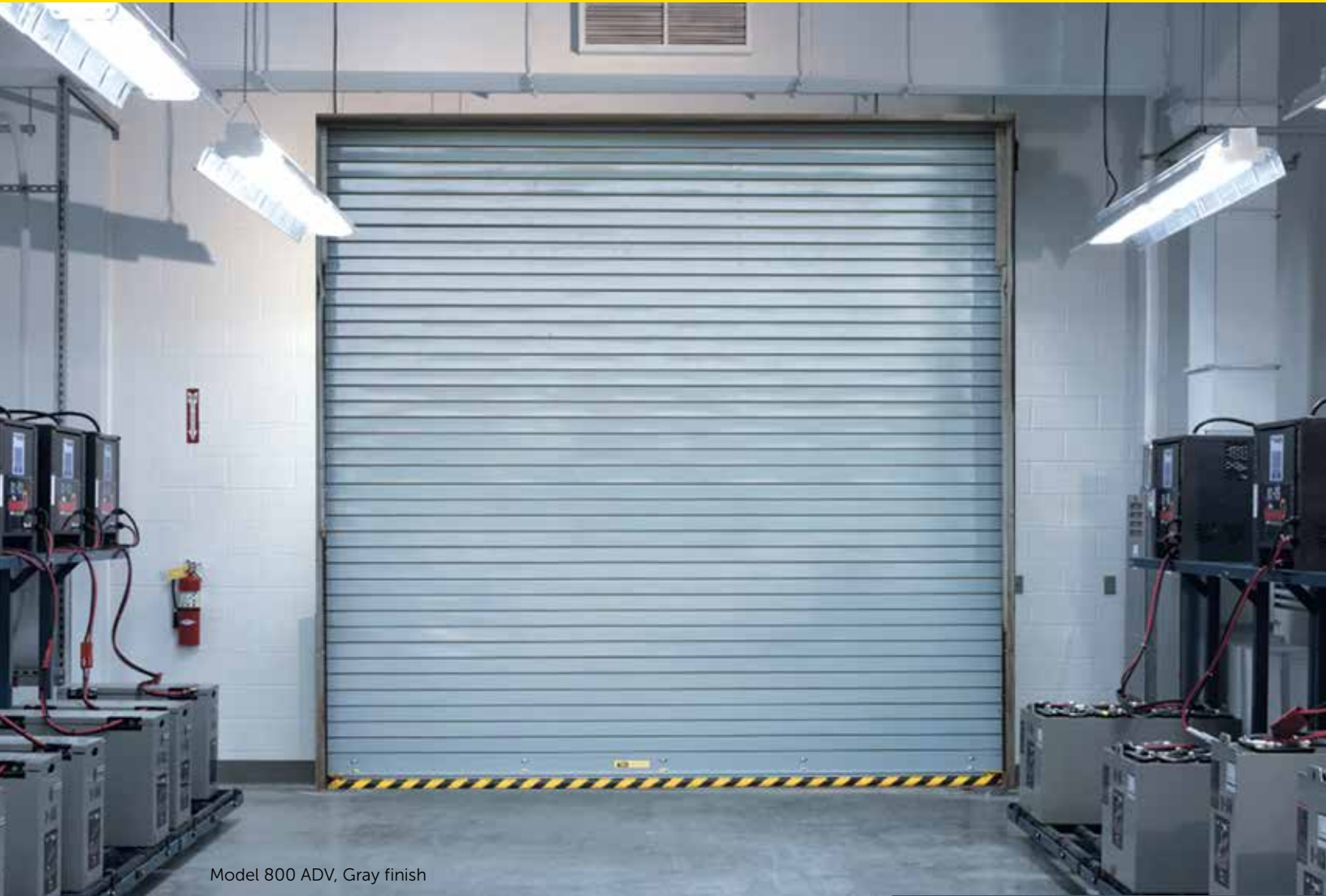
Model 800 ADV, Gray finish