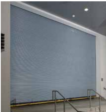
No. 4 slat

Secur-Vent® – Perforated slat provides optimal security and ventilation. Slat consists of \frac{1}{16} " diameter holes offering 17% open area over length of each slat. Available in No. 14 flat slat up to 22' wide x 20' high (available in 20-gauge steel only).