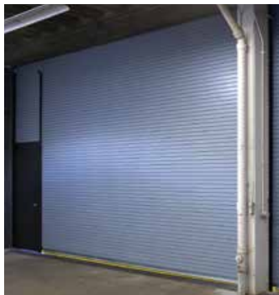
No. 14 slat, shown with a Pass Door