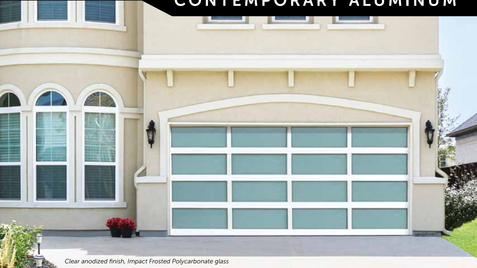
Clear anodized finish, Impact Frosted Polycarbonate glass

Clean modern styling for homes in high wind areas.