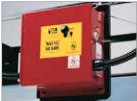
WayneGuard™ Fire Door Release Device