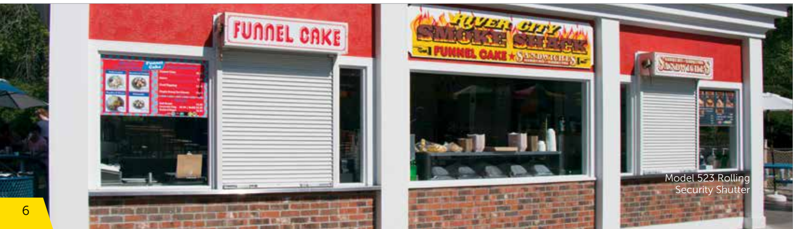
Model 523 Rolling Security Shutter