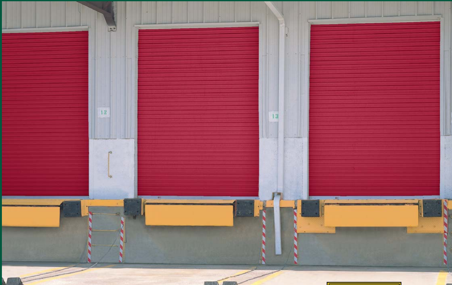
Windload Rated DS-350 Roll-Up Steel Doors