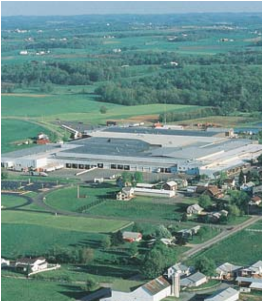
Mt. Hope, Ohio

Wayne-Dalton has built a broad, worldwide dealer network to better serve your needs.