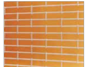
G-1 Pattern 4" (optional) G-1 Pattern modified 3.125"

For technical information, specifications, drawings, visit wayne-dalton.com . Not all patterns available in all sizes. Consult factory for more information.