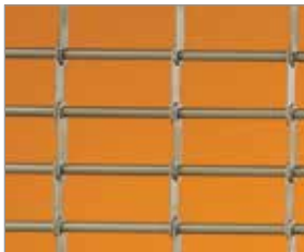
G-8 Pattern 4" (optional)