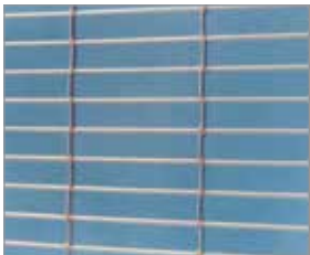
G-6 Pattern 9" (standard) Modified G-6 Pattern 6" available

Model 600 offers numerous grille patterns to choose from. The curtain construction is available in aluminum, galvanized steel, and stainless steel. Finishes include clear or bronze anodized aluminum, galvanized steel, stainless steel #4, and powder coat finishes (Approximately 200 RAL colors or custom colored to match architect specification).