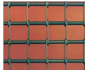
G-7 Pattern 2" (optional)