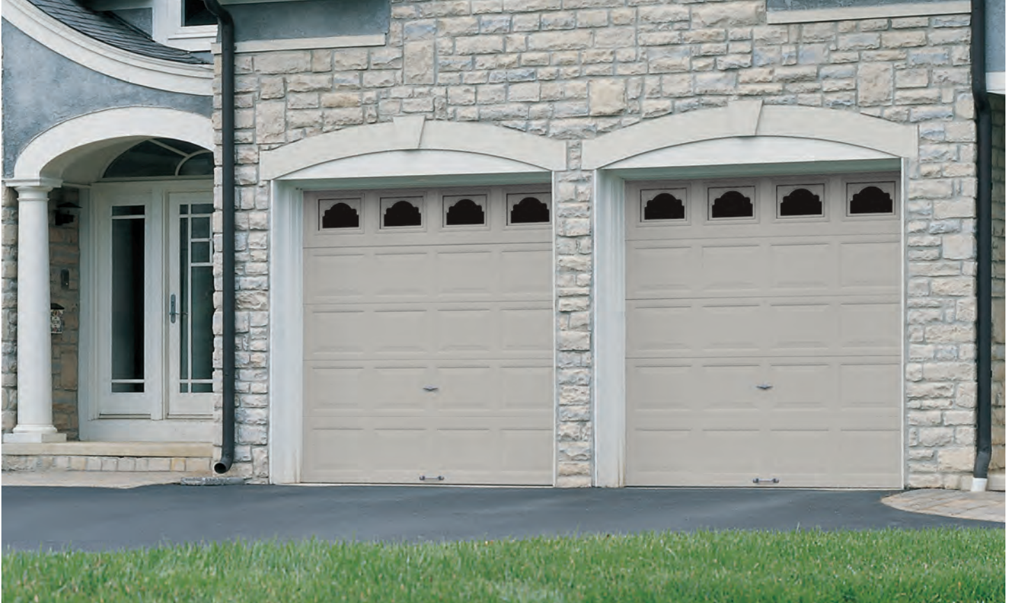
Model 8100 shown in Colonial design with Cathedral I window inserts.